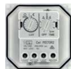
Simple dial setting